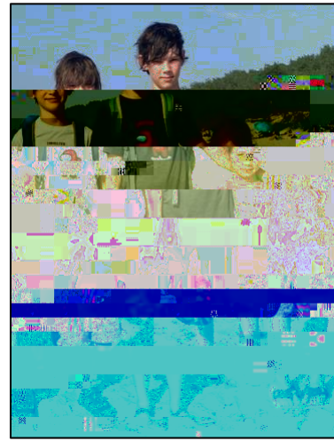
@0- &A0)3&. 9&B1!)&8". **23+&=>=?&

! H21!8$!/)!, 48!<4#1!6$#!78!)$!845!; $$1F5-Y!@!$, 48! 2$)!$2.5!4!8)45!4F#$41!6$#!78+!F7)!4!>$%=.-)-! #-$#/-2)4)/$2+!4!2-, !0/-, !6#%$!)<-!4F$41!$6! $7#!?-#%42!<$%-!421!4!>.$8-!-2>$72)-#!, /)<! )<-!NAH9!H21!6$#!78!)<-!/?@ABZDAB!, 48!4., 458! )<-!>-2)-#!$6!4..!$6!)<4)9! !